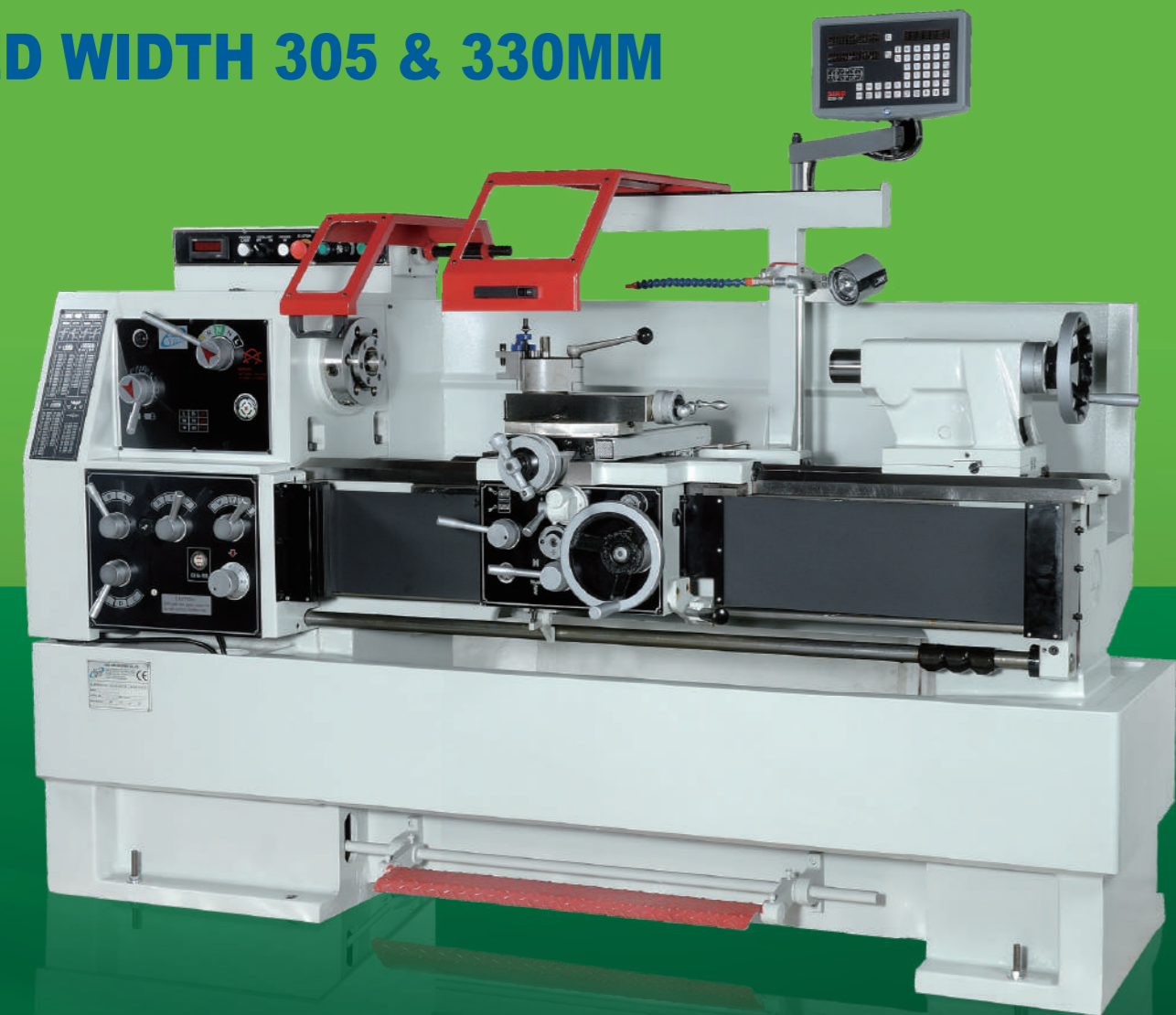
DY 410VS X 1000